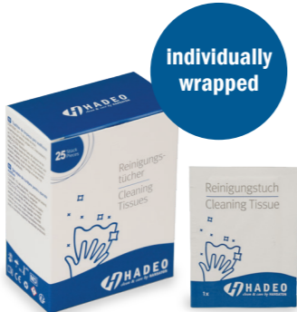
Cleaning Tissues for cleaning hearing aids Contains: 25 cleaning tissues individually packaged MOQ: 12 boxes 098-5465