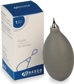
Air Blower to blow out tubes Contains: 1 piece MOQ: 6 pieces 098-5464