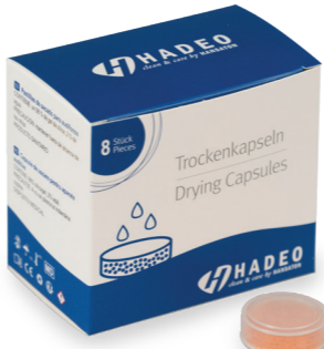
Drying Capsules/Tabs suitable for the Comfort Charger Combi or the Cleaning & Drying Cup Contains: 8 drying capsules MOQ: 12 boxes 098-5467