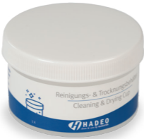
Cleaning & Drying Cup with sieve and screw cap Contains: 1 cup MOQ: 6 pieces 098-5466