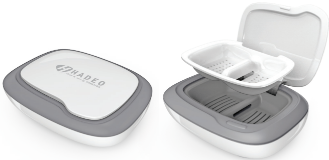
UV Dry Box Easy electronic UVC cleaning and drying. Suitable for rechargeable hearing aids. Contains: 1 UV Dry Box MOQ: 1 piece 098-5436 with EU plug