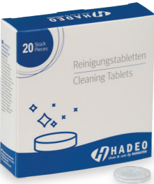
Cleaning Tabs for cleaning BTE ear molds Contains: 20 pieces MOQ: 24 boxes 098-5469