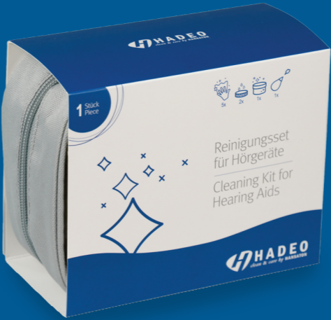
Starter Set for hearing systems in a reusable bag Contains: 5 individually packaged cleaning tissues, 2 drying capsules, 1 cleaning & drying cup, 1 air blower MOQ: 5 sets 098-5468