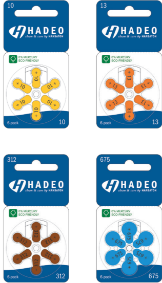
Batteries Size 10: 070-0514-424 Size 13: 070-0516-424 Size 312: 070-0515-424 Size 675: 070-0517-424 Contains: 6 batteries per pack MOQ: 10 packs