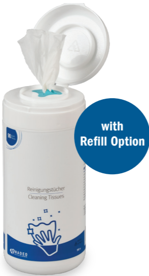
Cleaning Tissues in Dispenser for cleaning of hearing aids Contains: 90 cleaning tissues MOQ: 12 dispensers / 1 Refill Pack 098-5463 Dispenser 098-5349 Refill Pack