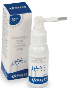
Cleaning Spray with dosing brush for cleaning ITE hearing aids Contains: 30 ml MOQ: 6 bottles 098-5462